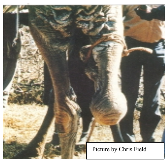
Camel suffering from mange

Avoid camels that have suffered or are suffering from major diseases, including physical conditions such as lameness. Camels that have old scars or lots of brand marks should be avoided as they may have chronic health problems. A camel that is alert, active and responds calmly to its environment should be selected